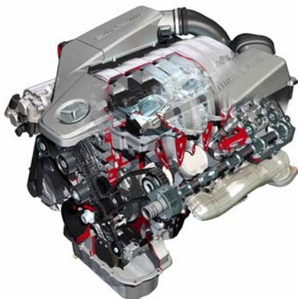
Technology transfer from motor racing: the AMG 6.3-litre V8 engine

The twin-wire-arc-sprayed (TWAS) coating on the cylinder walls – used exclusively by AMG – produces outstanding low-friction characteristics while reducing fuel consumption at the same time. The electronically controlled fuel supply is also highly effective: depending on the power requirements and outside temperature, the system operates at a demand-actuated fuel pressure of between 3.6 and 4.5 bar and is regulated practically instantaneously. The engine management system translates the command from the accelerator within milliseconds into the corresponding fuel pressure setting. Such control ensures rapid vehicle response and sporty acceleration across all load ranges and at all engine speeds.